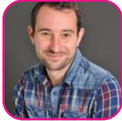
Teacher (Team Leader)